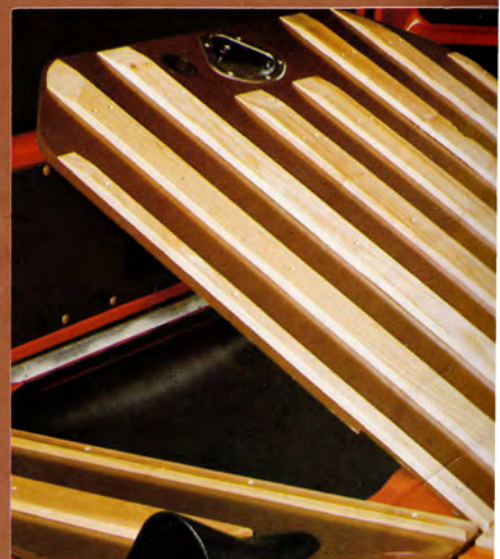
65 dm 3 cavity under the floor for concealing valuables when

Anatomically designed seats, finger tip controls, precise rack and pinion steering, excellent handling characteristics and a responsive 2.1 litre four cylinder engine with overhead camshaft and cross-flow cylinder head made of aluminium alloy combine to make the Volvo 245/2SL Van a pleasure at all times in all conditions, with or without load.