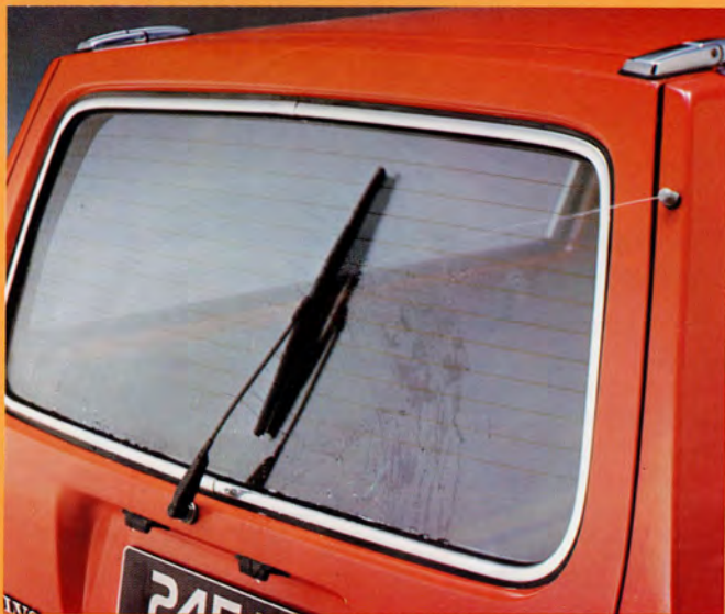
Rear visibility is of great importance. The Volvo 245/2SL Van is fitted with an electrically heated tailgate window, which is kept clean by a wiper/washer unit.