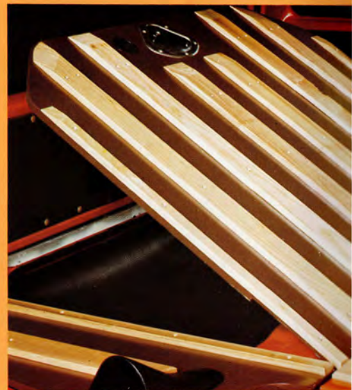
65 dm 3 cavity under the floor for concealing valuables when

Anatomically designed seats, finger tip controls, precise rack and pinion steering, excellent handling characteristics and a responsive 2.1 litre four cylinder engine with overhead camshaft and cross-flow cylinder head made of aluminium alloy combine to make the Volvo 245/2SL Van a pleasure at all times in all conditions, with or without load.