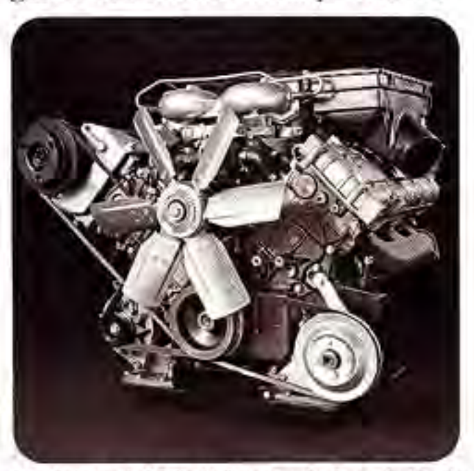
Fuel injected, B27F, V-6 engine features light-alloy construction.

standard unit that best complements your driving style. The choices are: a four-speed manual gearbox with electrically-activated