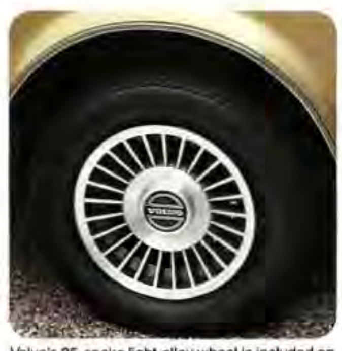
Volvo's 25-spoke light-alloy wheel is included on the 264GL and 262C. It's also available on the 240 Series.

The 262C's performance-tuned suspension continues to offer first-rate handling, improved for 1979 with the addition of high performance shock absorbers. European profile, Michelin steel-belted radial tires and distinctive light-alloy wheels are standard on the 262C.