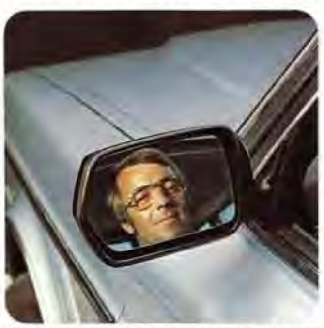
Power rear view mirrors make adjustments simple.

light, that remains lighted while you find your key and the ignition switch, two-section storage compartments in each front door, map pockets on the seat backs, and courtesy lights in both the trunk and the engine compartment. That's a thorough, complete list ... and it's all there. See what we mean by value as it relates to luxury? With this extensive list of equipment, the 264GL's accessories are of necessity limited. But you can personalize your 264GL with your choice of AM/FM stereo, CB or tape player, cruise control, and ski or luggage