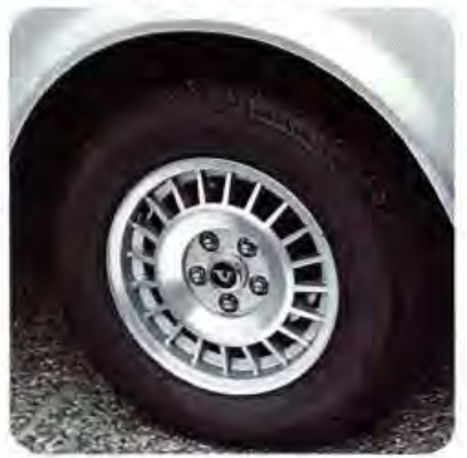
Standard 242GT light-alloy wheel is available as an accessory.

improving steering control. These, plus the same heavy-duty vented front disc brakes found on Volvo's 260 Series cars, let the dedicated enthusiast take on the most demanding roads with a confidence that comes easily . . . a confidence that's familiar to every driver who genuinely enjoys high performance cars and high performance driving.