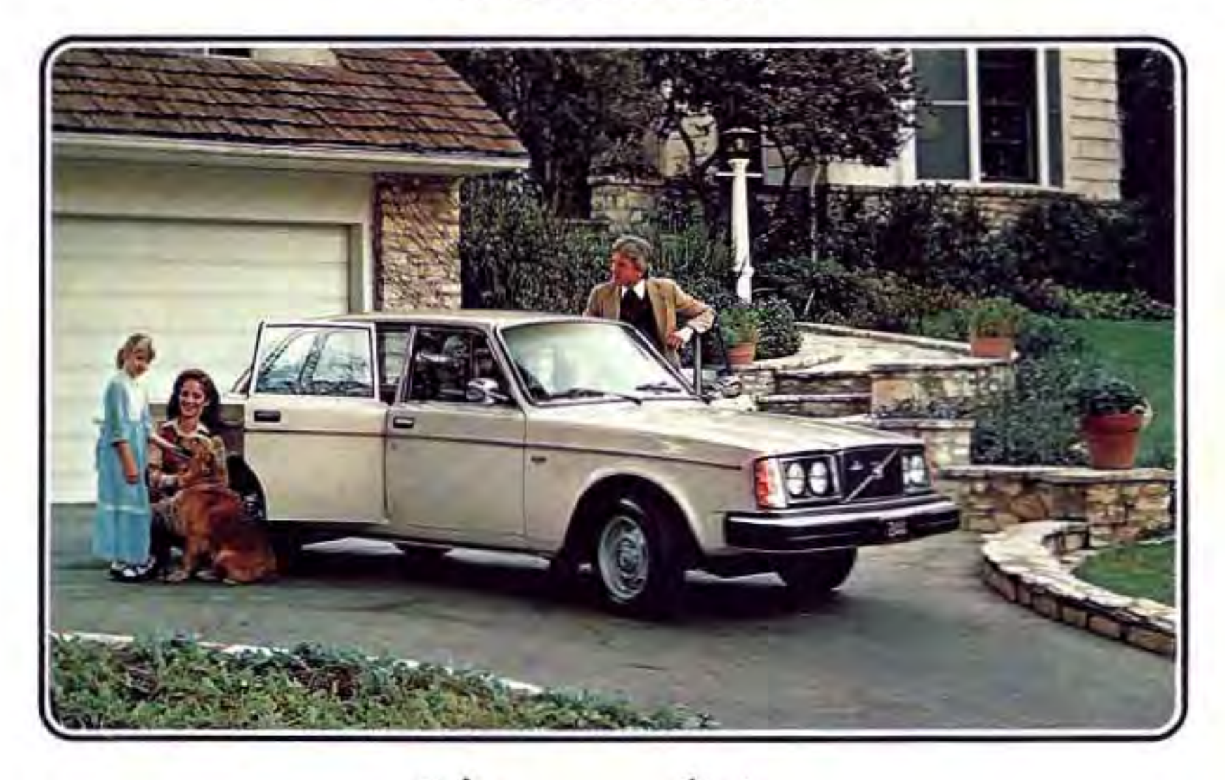
It's a tradition.

The 1979 Volvo 240 and 260 Series sedans are cars built to be driven and enjoyed. We think you ought to see and drive a Volvo for yourself to experience its quality and value. Do it soon.