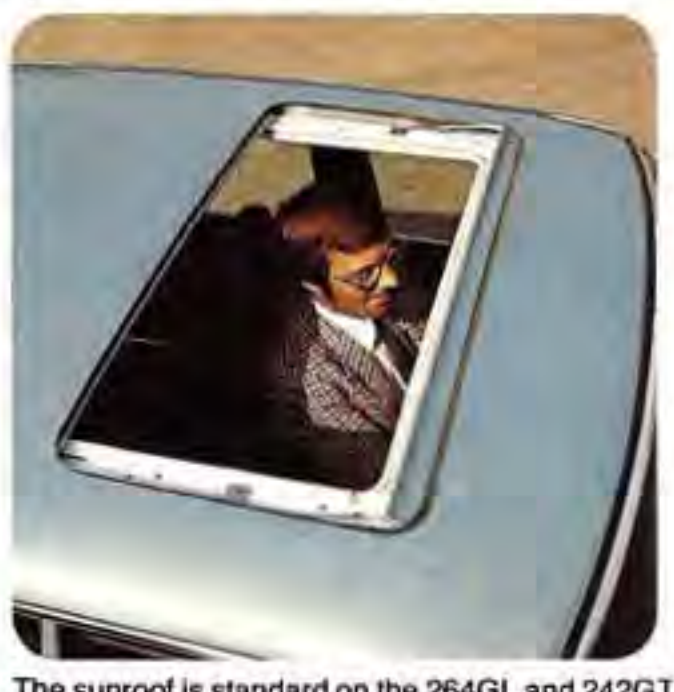
The sunroof is standard on the 264GL and 242GT. It is optional on the 242 and 244 sedans.

As if all this were not enough, virtually everything passengers need for motoring ease and convenience is provided with the 264GL. Power-assisted steering and brakes make driving easier. A 12-outlet heating and air conditioning system makes it more comfortable.