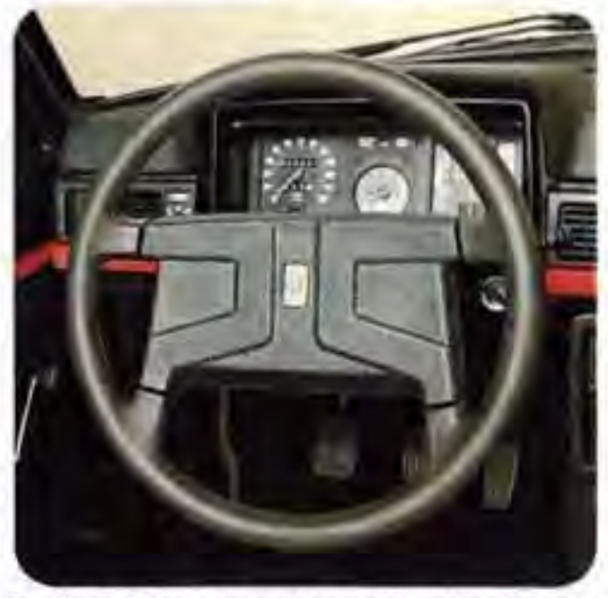
The GT instrument panel (not shown) and steering wheel are Volvo accessories. The steering wheel is standard on the 242GT.

New thicker-than-standard front and rear stabilizer bars (that add an important 35% more roll stiffness than standard 240 Series Volvos) provide better ride control and cornering characteristics without sacrificing ride comfort, and new high performance shock absorbers provide quick-response damping, further reducing vibration while