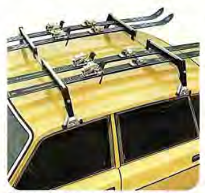
For extra carrying capacity, accessory ski or luggage racks are available.

Also included at no charge with every Volvo sedan is one of the industry's finest durability programs. Because Volvo believes in delivering value for money, we believe that you deserve the best in durability. And we do our best to insure durability by giving every Volvo body a comprehensive application of rust-preventive measures: zinc coating of rust-susceptible compo-