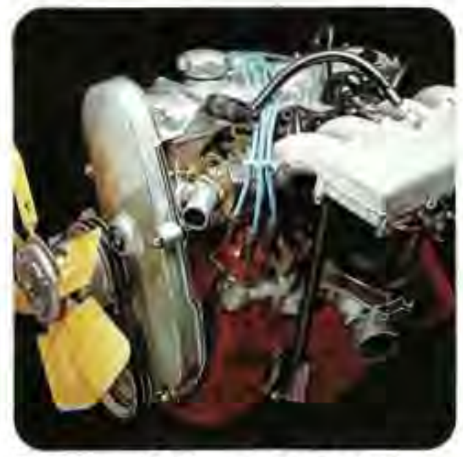
Fuel-injected B21F four-cylinder, overhead-cam engine with "cross-flow" cylinder head.

Foremost, Volvos are engineered to provide the maximum in driving pleasure. Even though top speeds are limited by law, the excitement of driving a quick, responsive automobile remains undiminished.