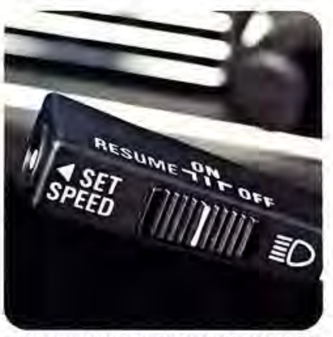
For highway driving, cruise control is especially convenient. It's standard on the 262C and available on all other models.

The luxurious comfort of the 262C interior is replete with designed-in convenience. Individual