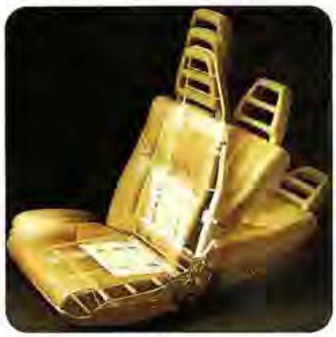
Exceptional comfort is the result of orthopedic design and quality construction.

Volvo uses the science of ergonomics to reduce distractions. Ergonomics, put simply, means making man's use of machinery more efficient and comfortable, and Volvo's application of ergonomics has resulted in these driver-oriented features; a nine-