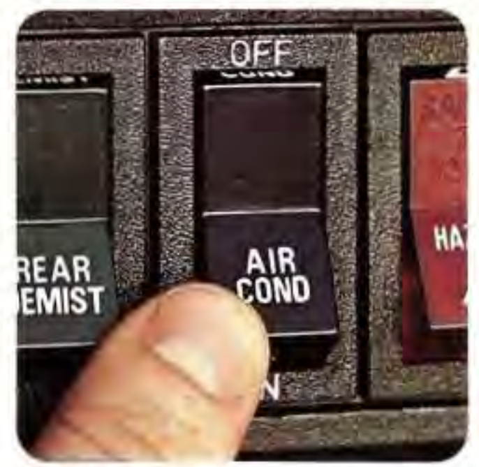
Air conditioning provides a cool ride in summer heat. It's an accessory on the 240 Series.

The 1979 Volvo 264GL has been designed with durability as a prime consideration. Not because it contributes to customer satisfaction, but because it contributes to value ... for without value there can be no customer satisfaction. Few cars at any price can boast more attention to rust prevention or attention to component design and installation. From the exhaustive anti-rust procedures to the multi-lay exterior paint, step after step is taken to insure Volvo's longevity. Volvo's painting procedure deserves special mention. The 264GL's metallic colors are applied in four layers, including a clear finishing coat. The sheet metal below the beltline, including doors and rocker panels, is protected from rock damage by wet-on-wet applications of resilient polyester that prevents most paint chipping ... a prime example of efforts made by Volvo to protect your investment.