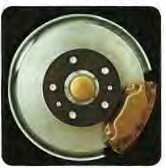
Four-wheel disc brakes are standard. The front discs are ventilated on the 242GT and 260 Series.

The system is costly but effective ... as are Volvo's four-wheel power-assisted disc brakes and stepped-bore master cylinder (which maintains hydraulic system pressure and near-normal pedal effort should a circuit fail ... an important safety feature). But Volvo considers this brake system the best that can be built into a production automobile ... and because we feel it's the best, we wouldn't do it any other way.