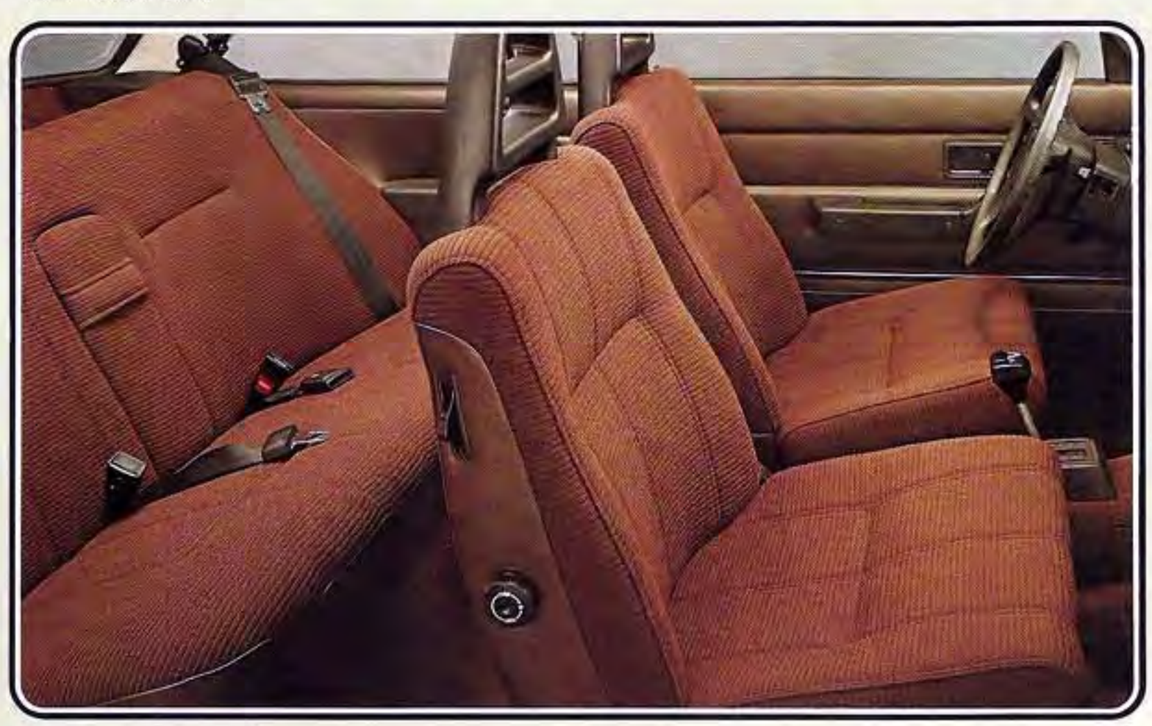
242 Two-door sedan in Carlsbad Yellow with matching upholstery.