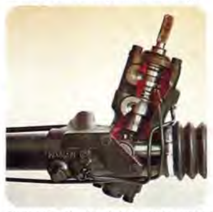
Power-assisted rack-and-pinion steering provides precise, positive control. It is standard on most Volvo models.

Naturally, the 242GT has all the equipment standard to all Volvo 240 Series cars . . . four-wheel disc brakes, rack-and-pinion steering,