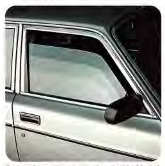
Power windows are standard on the 264GL and 262C. Also available on the 240 Series.

legheny Black exterior, the seats are upholstered entirely in a tastefully restrained grey velour. Custom door trim and thick, plush carpeting enhance the quality feel of every 264GL.