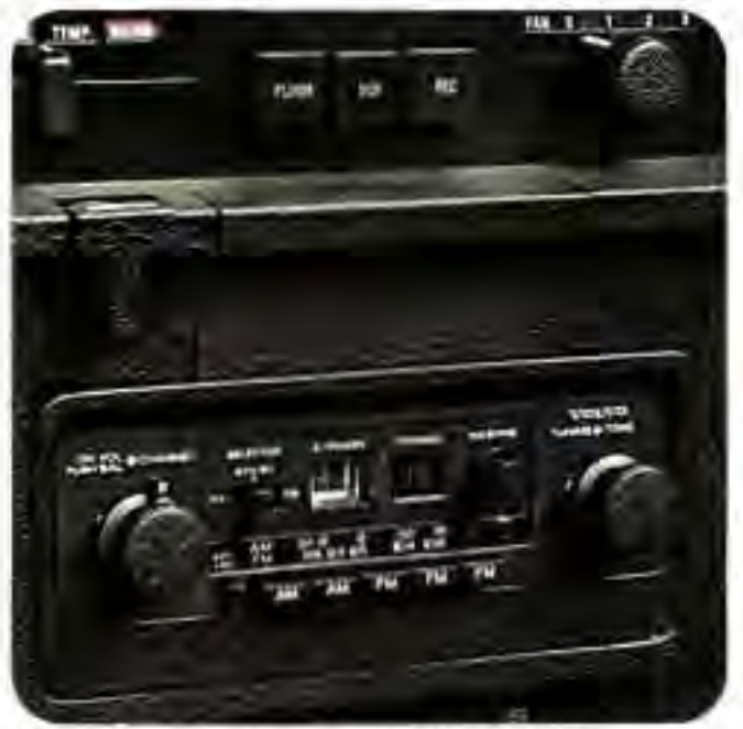
Keep in tune with your neighbor. Volvo's accessory Audio Center includes a 40 Channel CB unit and AM/FM stereo radio.

for extra comfort and the seethrough headrests are covered with leather. This attention to interior detail and quality help explain why the 262C will only be built in limited numbers.