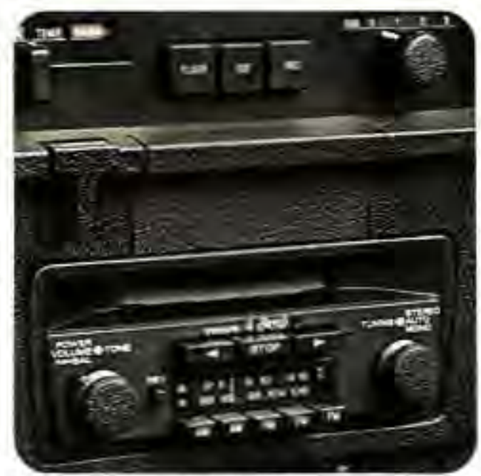
Select an accessory radio of your choice; AM/FM, AM/FM Stereo, AM/FM Stereo with Cassette Player, or AM/FM Stereo with 8 Track Tape Player.

The smell and feel of fine leathers give the 262Cs interior an air of tasteful luxuriousness. Soft pleated leather covers the anatomically designed and individually heated front seats, and the spacious rear seat of this genuine 2+2 touring car. Leather also covers the doors and rear panels, black leather harmonizing with the classic Mystic Silver metallic paint and beige leather offered with this year's new Coronado Gold metallic exterior finish. Door panels are accented with genuine elm veneer and the leather-covered sun visors are recessed into a full-width leather panel above the windshield. The special steering wheel is padded