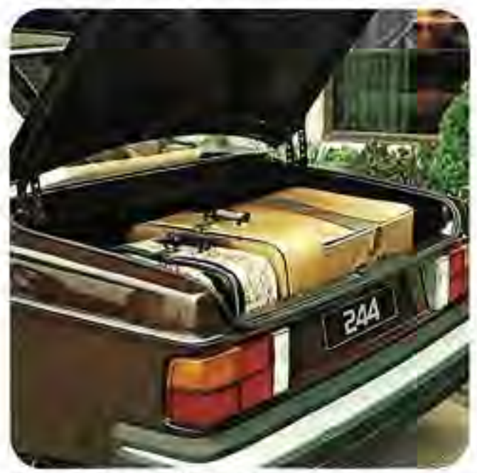
A large, deep trunk provides ample luggage room for five adults. A courtesy light is standard.

Outside, the rear deck of the 1979 Volvo has been redesigned in order to improve access to the large luggage compartment. This big, fully carpeted trunk enables even large families to take along