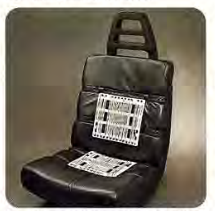
The 264GL and 262C have a heated driver's seat to warm you in winter. On the 262C, the passenger seat is also heated.

num alloy bumpers — backed by special impact absorbers designed to withstand a 5 mph bump with no damage — are dressed up with a new shiny finish for 1979.