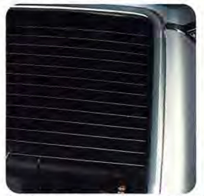
The electric rear window defroster is standard on all Volvos.

Like all 1979 Volvos, the 262C rear deck offers both improved appearance and easier access to the luggage compartment. This exterior change, plus the steeply raked windshield and lower roof line unique to the Bertone-bodied 262C plus black vinyl roof with the Mystic