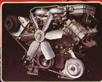
B27F, V-6 engine

Volvo wagons are designed to perform when you need it. And, they can pull up to 2,000 lbs. Towing accessories are also available.