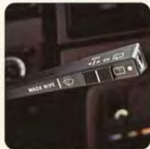
The rear window wiper, has an intermittent cycle on the 265GL, which is available for the 245. The control is on the steering column.

be changed by resetting a few bolts). The seats are supported internally for long-lasting resiliency and comfort and are designed, statistically, to fit 95% of the North American adult population. The rear seat is supported by springs and foam padding for greater comfort. There's ample leg and headroom for five adults. And, when you need extra cargo area, the rear seat conveniently folds forward.