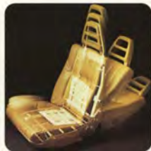
The Volvo seat adjust nine ways to give you a more comfortable ride.

The front passenger seat is also fully adjustable (the seat height can