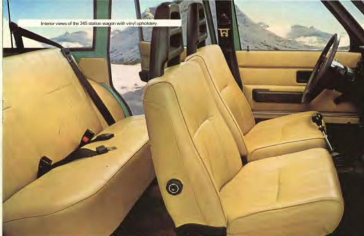
Interior views of the 245 station wagon with vinyl upholstery.

Other passenger comfort and convenience features include: tinted glass with a dark tint band in front for greater glare reduction, convenient storage compartment