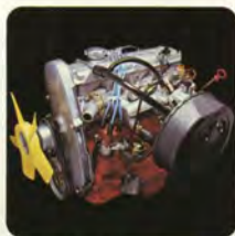
B21A, in-line, four-cylinder engine.

Also included with every Volvo wagon at no extra charge is one of the automobile industry's finest and most thorough durability pro-