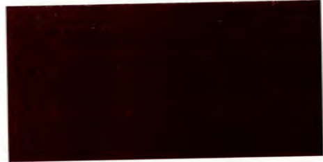
138 Durango Brown