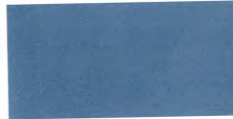
139 Appalachian Blue