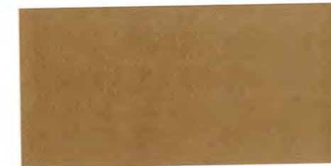
135 Coronado Gold Metallic