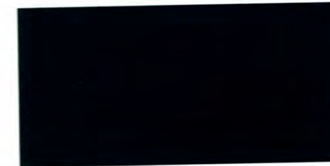
136 Cypress Green Metallic