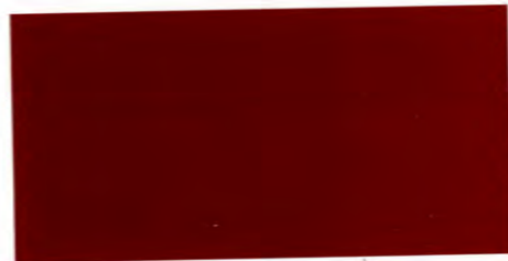
125 Cimarron Brown