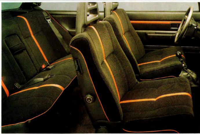
Volvo 242 GT with corduroy upholstery and red vinyl striping.