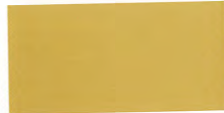
128 Carlsbad Yellow