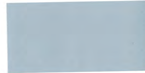
134 Avalon Blue Metallic