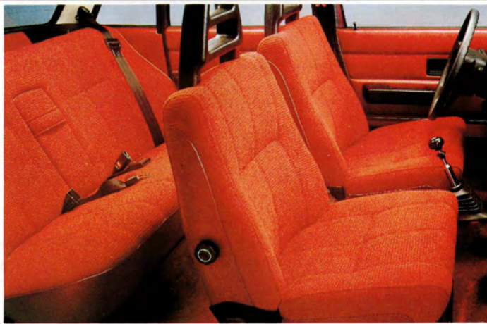
Volvo 244 with cloth upholstery.