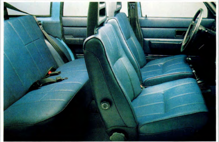
Volvo 245 with vinyl upholstery.