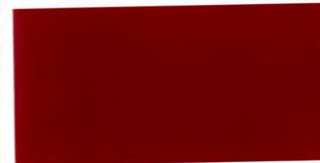
129 Cherokee Red