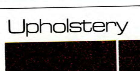
138 Durango Brown