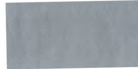
130 Mystic Silver Metallic