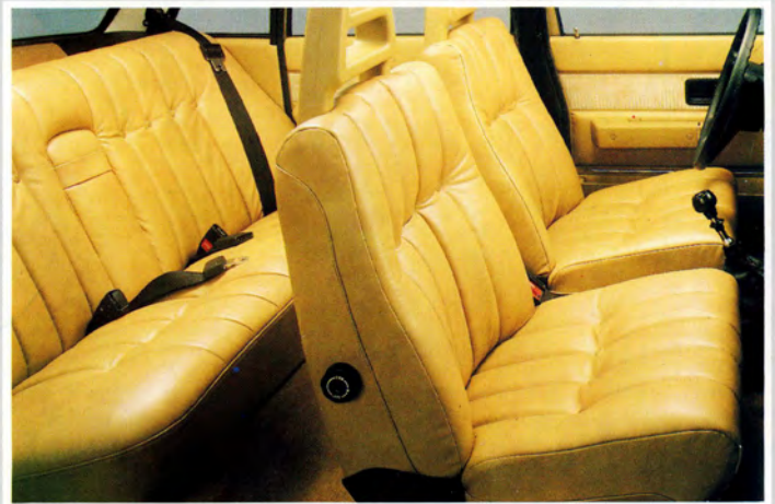
Volvo 264 GL with leather upholstery.