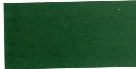
140 Lexington Green