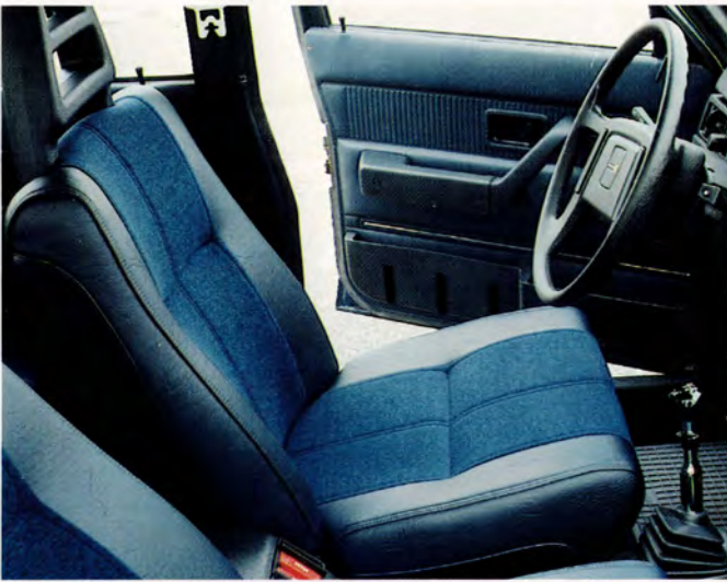
Volvo's driving seat is anatomically shaped and provides the correct lumbar support for the driver.