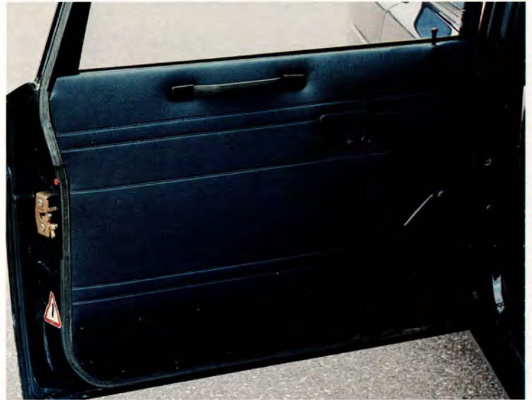
Sturdy handles on the side doors make it easier to enter and leave the car. The doors are also fitted with protective kick plates.

The Volvo Transfer is built with safety in mind. The front of the vehicle incorporates a long deformation zone which absorbs impact forces in the event of an accident. The safety cage design provides good protection for passengers and driver.