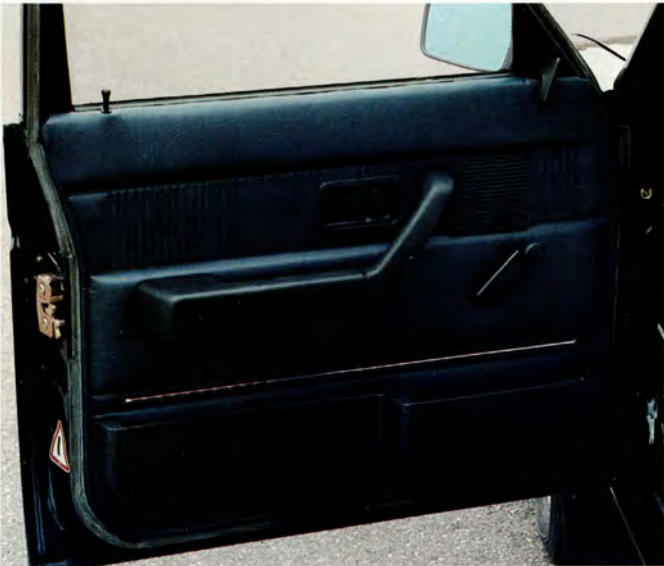
Both front doors are fitted with roomy storage compartments.