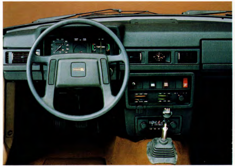
The excellent driving position with all controls and instruments within easy reach and sight takes the strain out of long hours of driving.