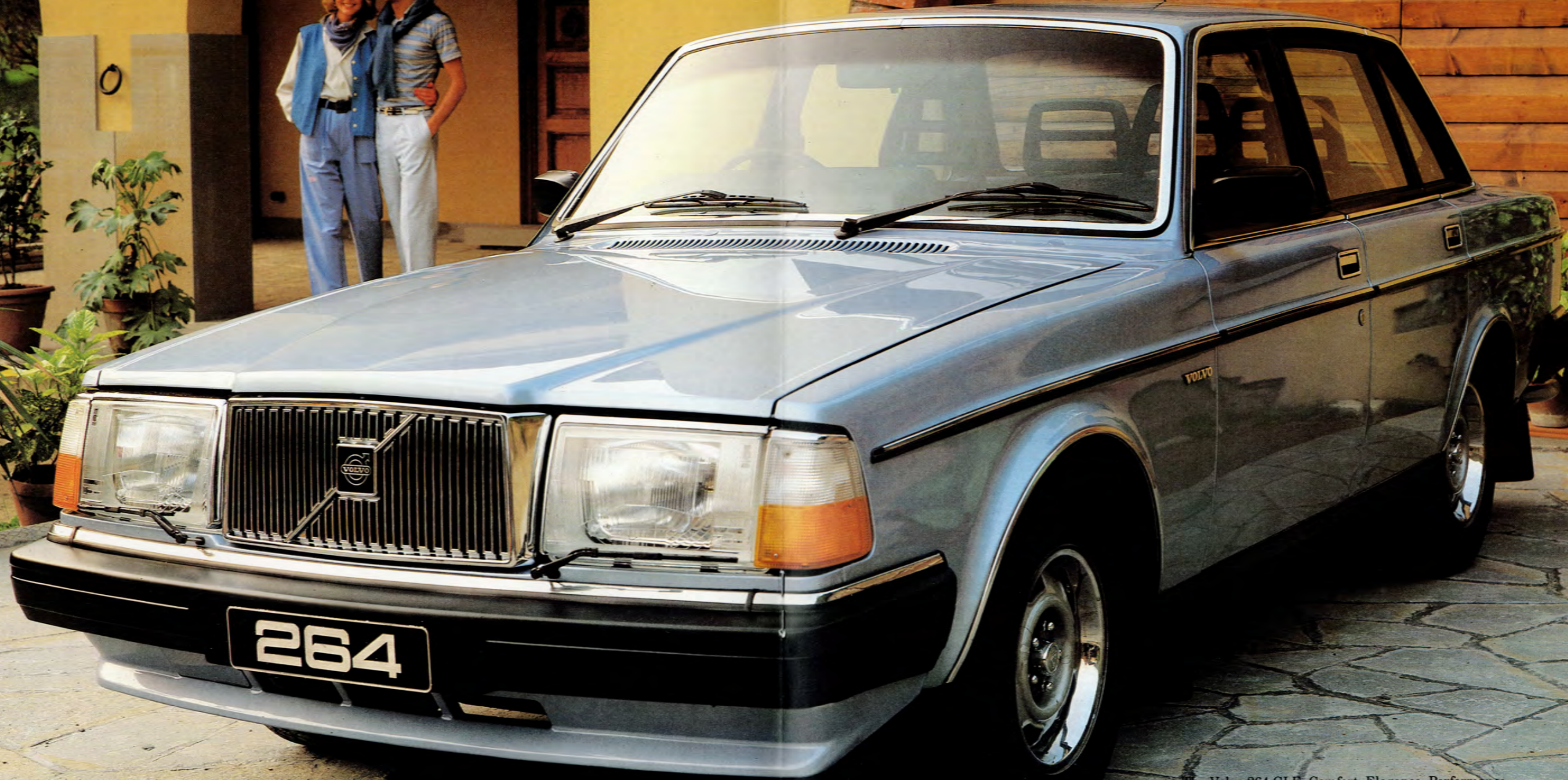
The Volvo 264 GLE. Comfort. Elegance. Performance.