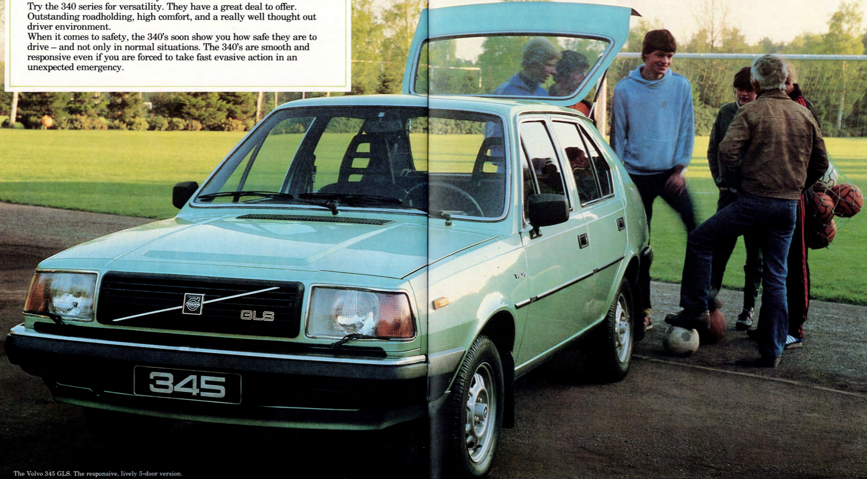
The Volvo 345 GLS. The responsive, lively 5-door version.

When it comes to safety, the 340's soon show you how safe they are to drive – and not only in normal situations. The 340's are smooth and responsive even if you are forced to take fast evasive action in an unexpected emergency.