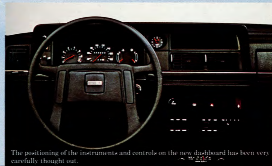
The positioning of the instruments and controls on the new dashboard has been very carefully thought out.

With a Volvo station wagon, you can forget all about problems with luggage. It is so much quicker and easier to load your luggage and equipment into a Volvo 245 or 265 (265 version only available with US specification). Sailing equipment, skiing gear, the baby's pram and chair. You do not need to struggle with one of our station wagons. They really add pleasure to your leisure. There is room for five adults – in comfort. Plus a cargo space that swallows all of 1.2 cubic metres of luggage. Or if you want to use the station wagon as a small truck, the cargo space increases to as much as 2.15 cubic metres. The best thing with Volvo's station wagons is that you travel just as comfortably as you do in Volvo's cars. And they are renowned for their comfort. And with the same driving and handling characteristics. The same secure safety. This means that the Volvo station wagons are easy to drive in heavy traffic. Practical, too, when it comes to parking in tight spaces. And with a turning circle that is better than a lot of much smaller cars. Only 9.8 metres!