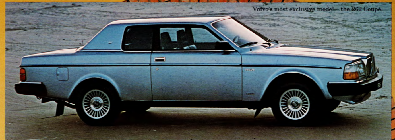
Volvo's most exclusive model – the 262 Coupé.

Really exclusive cars are often more expensive because of their extra equipment. But with Volvo's exclusive cars, the 264 GLE and the 262 Coupé, you get standard equipment that is an extra on other cars. That is why Volvo's exclusive cars are such good value for money. The cleanly styled exteriors emphasize just how exclusive they really are – but without ostentation. The cars are powered by smooth, quiet, compact V6 engines. And the standard equipment includes overdrive, power-assisted steering, rev counter, sunroof, electric window lifts and electrically adjusted door mirrors. The Volvo 262 Coupé is even more luxurious – with leather upholstery and door panels trimmed in choice wood.