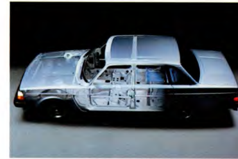
Safety cage and deformation zone.

for money. Since it holds its price for a great many years.