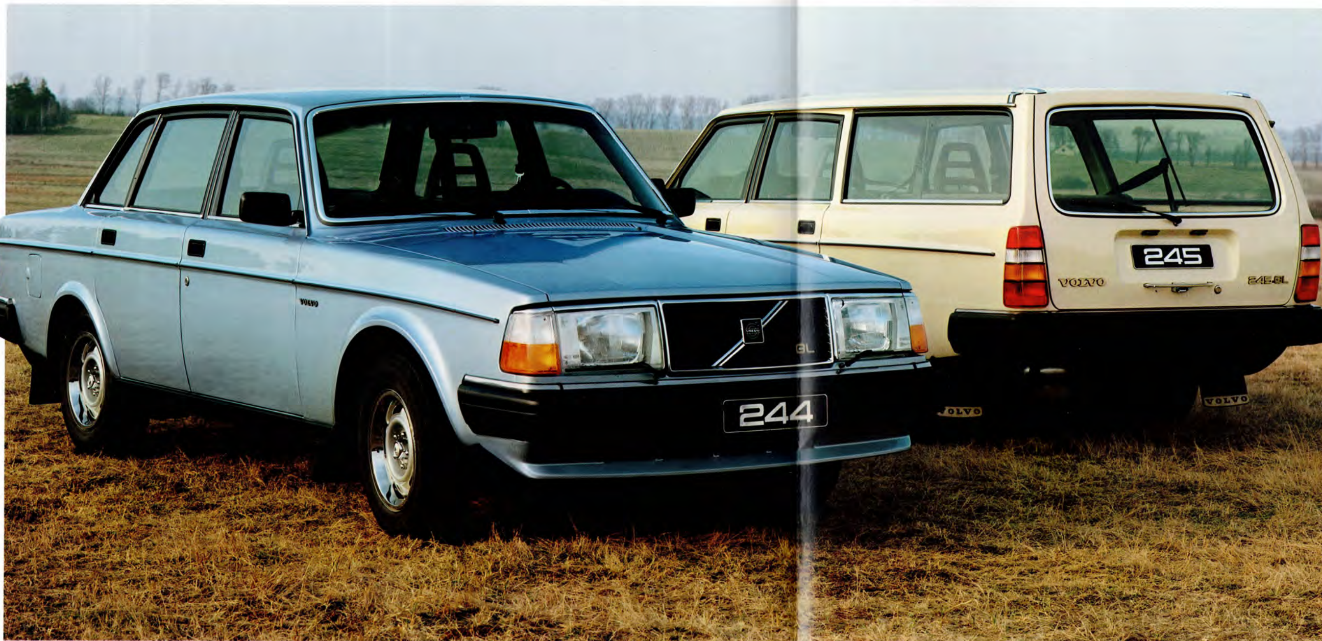
Volvo 244 GL, Volvo 245 GL.