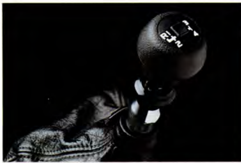
Smooth overdrive with automatic disengagement.

cylinder means that you do not need to increase the pressure on the brake pedal to any noticeable degree in such a situation.