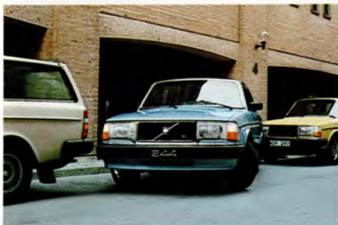
Supreme turning diameter, 9.8 m.

Efficient heating and ventilation make sure that you are comfortable and the atmosphere is pleasant in all climates and weathers. 14 air inlets, separate ones for the back, make sure that the temperature in the passenger compartment is the right one. Full fan capacity and a full range of adjustments complete your comfort, as far as fresh air and temperature are concerned.