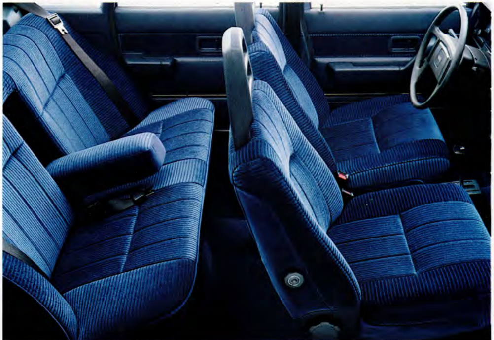
Seating comfort, air comfort, travelling comfort.

Which is why we got medical experts to develop Volvo's driving seat by doing various tests. The result is a seat with such an advanced range of possible positions that it can provide 97% of all adults with the ideal driving position.