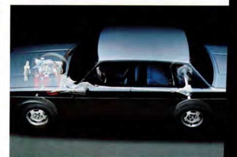
Wheel suspension for maximum road contact.