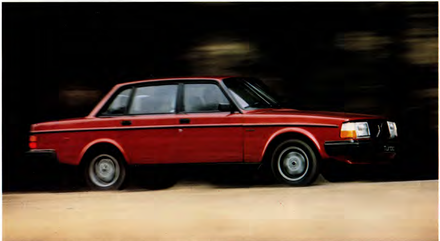
The power package, the Volvo Turbo. On the exterior, in the interior and under the bonnet, an exclusive dynamic creation.

The Volvo Turbo is only available as a sedan and in two metallic finishes: Red and silver. Equipped with 5-spoke 6" aluminium rims with 195/60 HR 15 extreme low-profile tyres.