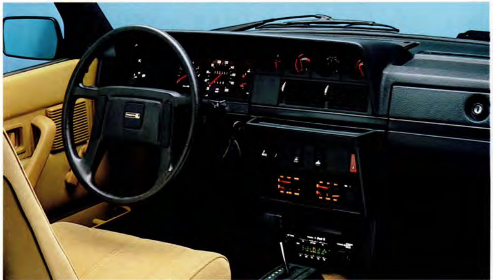
Total comfort behind the wheel.

The most important thing, of course, is that you have a good driving seat. A driver who always sits comfortably is a more relaxed driver. And, therefore, a safer driver.