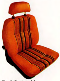
Red Stripe 1)