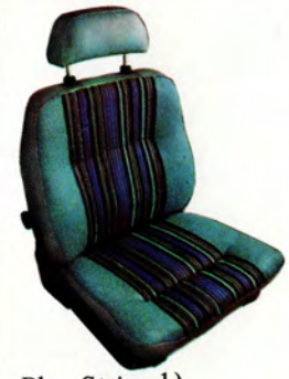
Blue Stripe 1)