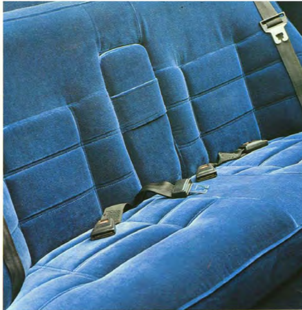
Body-supporting Volvo seats are upholstered as fine furniture: Plush velour (above) for the 264 GL, soft-napped cloth (below) for the 264 and elegant leather with vinyl trim (right) for the GL models.