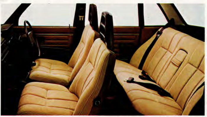
The Volvo 244 DL has durable cloth upholstery. All interior trim is flame resistant