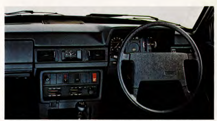
The instrumentation includes a comprehensive system of warning and reminder lights

Front: spring strut type incorporating coil spings and double-acting telescopic shock absorbers.