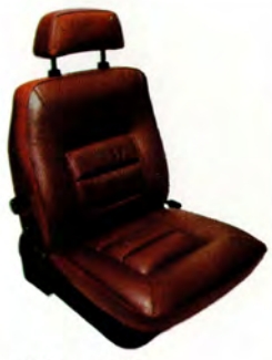
Wine red 2)