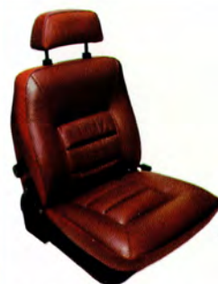
Wine red 2)

2) Volvo 164 E is only available with metallic finish