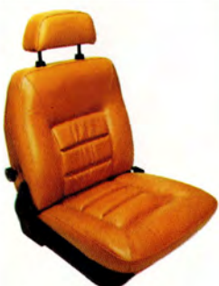
Natural leather 2)