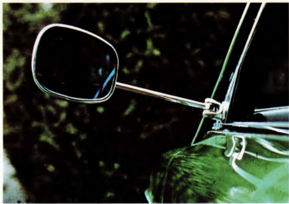
MIRROR EXTENSION — Ideal for hauling a trailer. Increases rear visibility. All models