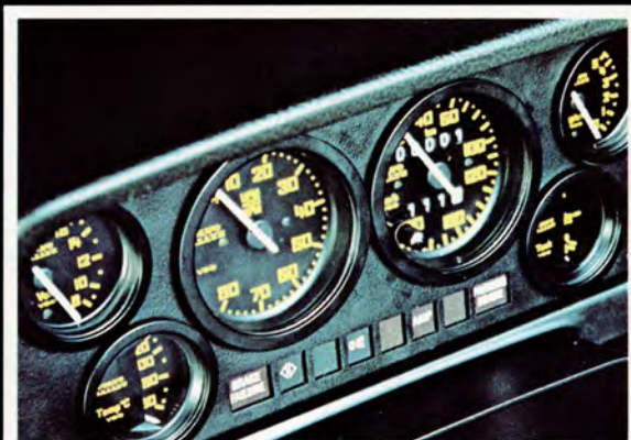
GT INSTRUMENTS — Full instrumentation with yellow figures on black background with reflection-free glass. All models