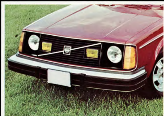
GRILLE LAMP KITS — These attractive kits are available in clear spot also clear and amber fog. 240 Series