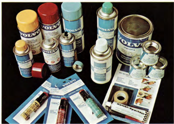
A full range of original Volvo touch-up paints, waxes, and polishes are available through your local Volvo Dealer.