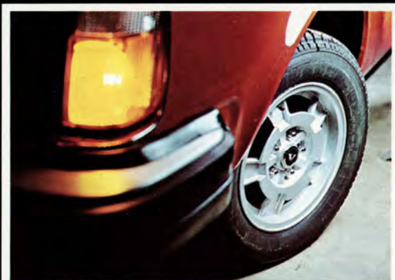
GT WHEELS — Exclusive 14" aluminum wheels are strong, attractive, 5½" wide and weigh only 12½ lbs. each. All models