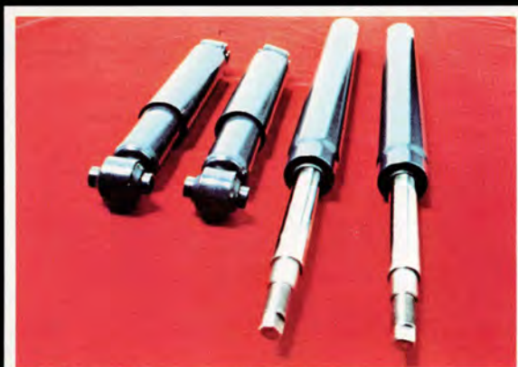
GT SHOCKS — Heavy-duty shocks mean tougher suspension, better control on rough roads and curves, especially at higher speeds. Front and rear sets. All models