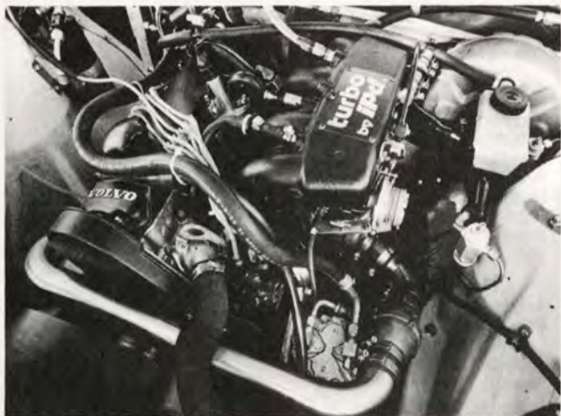
Turbocharger mounts to stock exhaust manifold. Pressurized air is pushed into the intake manifold via a chrome pipe running in front of the engine. Emissions systems is in place and operational.

ductive to spirited driving. Bilstein gas-filled shock absorbers are used to damp all this commotion.